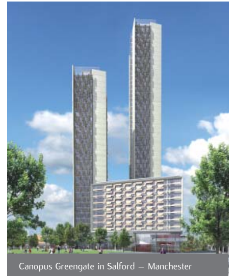
Canopus Greengate in Salford – Manchester

We have also been asked by BSC Group to find upscale hotel operators for two hotels it is developing within the Canopus Greengate development in Salford, Manchester. Finally, Greenwich Hospital Trust has instructed us to find a hotel operator for a boutique property, which is to be developed as part of the planned regeneration of London's Greenwich Market.