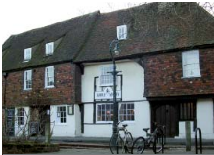
Simple Simons pub – Canterbury