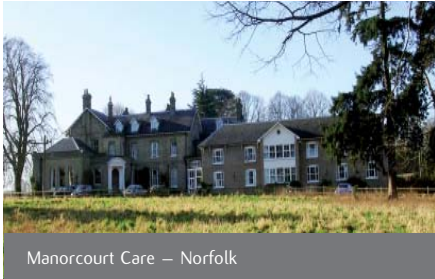
Manorcourt Care – Norfolk

Christie + Co's Corporate Childcare team advised Lloyds Development Capital throughout the due diligence process involved in its acquisition of nursery group Kidsunlimited, which has an estate of over 50 nurseries, generating sales in excess of £30 million. The vendors, equity house ISIS, reported an exit price from the Wilmslow-based group of around £45 million.